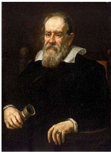
Galileo Galilei (1564-1642) [Refracting Telescope]