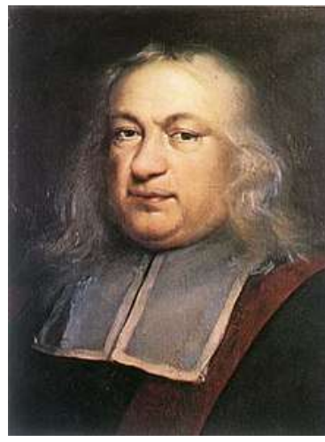
Pierre de Fermat (1607-1665) [College Dropout, Fermat's Principle]