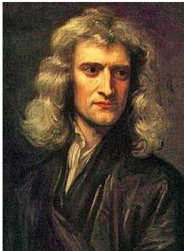
Isaac Newton (1643-1727) [Gravitation, Light Corpuscule, Cooling Law]