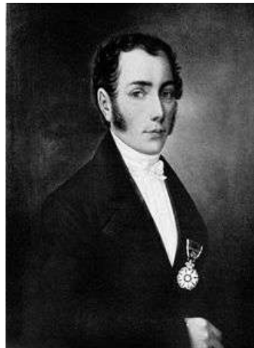
Joseph von Fraunhofer (1787-1826)