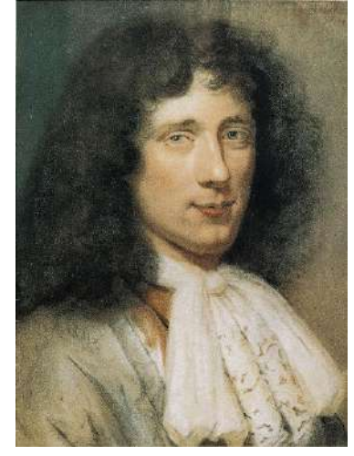
Christian Huygens (1629-1695) [Proposed Wave Theory, Saturn's Ring, Centripetal/fugal Force]