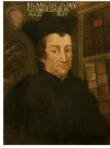
Francesco Maria Grimaldi (1618-1663) [Diffraction, Grating]