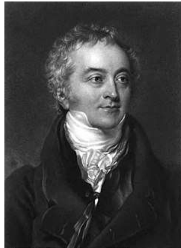
Thomas Young (1773-1829) [Proved Wave Theory]