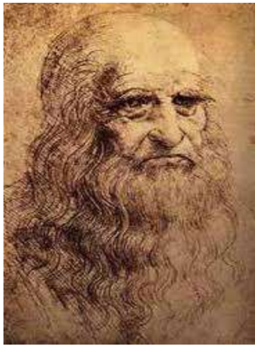
Leonardo da Vinci (1452-1519) [Pinhole Camera, Diffraction]