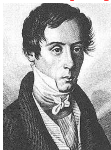
Augustin-Jean Fresnel (1788-1827)